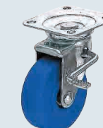
Monomer Casting Nylon Wheel