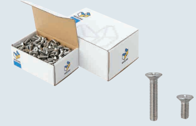
Machine Screws – Phillips Flat Head (Box)