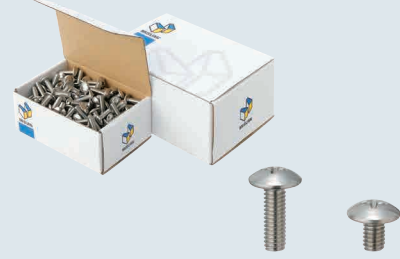
Machine Screws – Phillips Truss (Box)