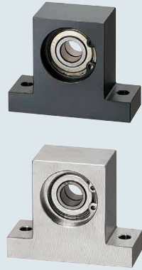
Bearings with Housings – T-Shaped Short Double Bearings, Retained